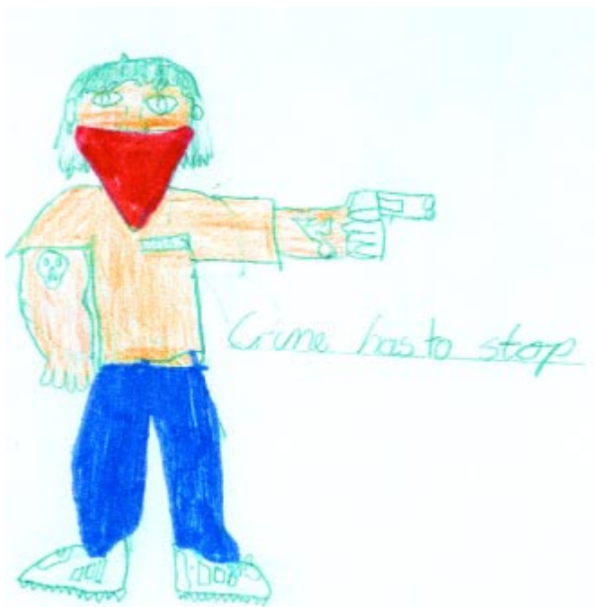
Boy, Year 5, Northview Primary School.

Get London boroughs and others to talk to children and young people when they make plans on things that affect them and listen to their views.