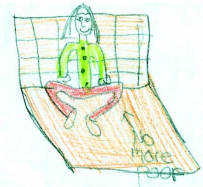
Girl, Year 5, Northview Primary School.

Making sure fewer children and babies have to live in bed and breakfast , and that they can use health, education and social services .