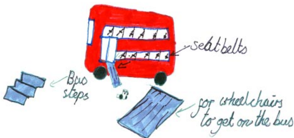
Girl, Year 5, Northview Primary School.

Work with schools to make sure that it becomes safer to use public transport.